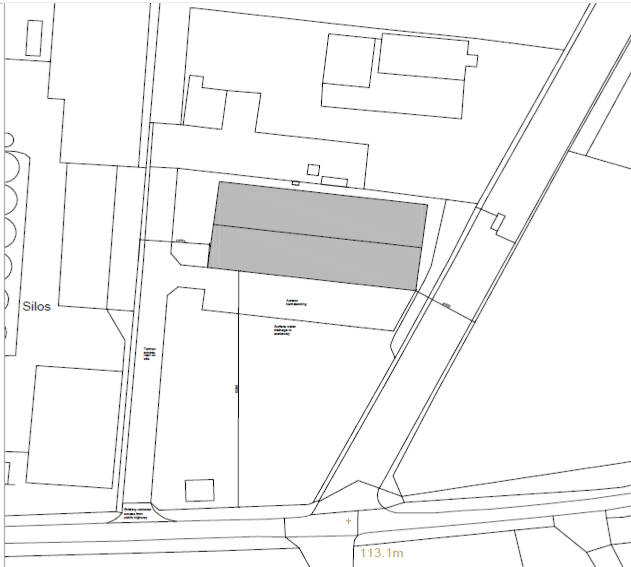
PROPOSED SITE PLAN - 1:500