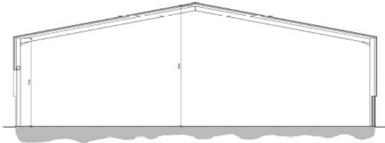
PROPOSED SECTION 1:100