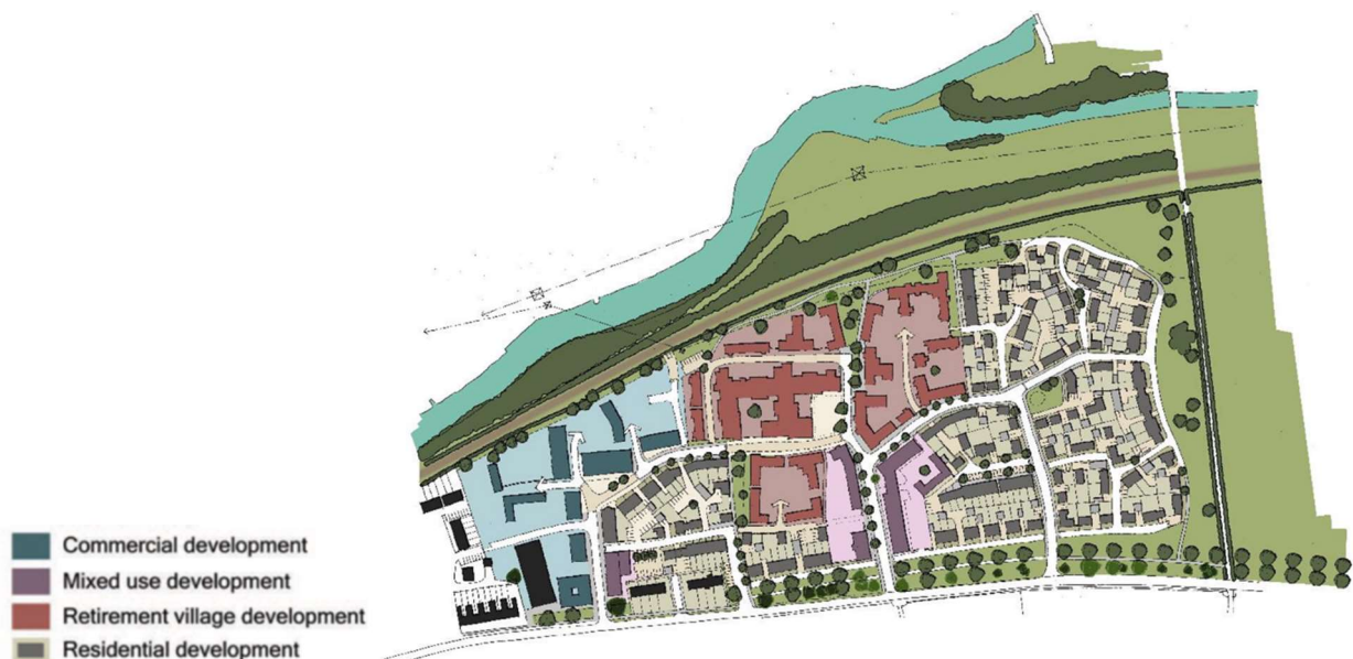
Masterplan of the Development