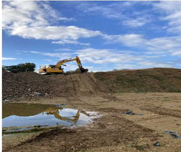
One of the Three Stockpiles left on site