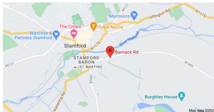
Map 1 Location of the Site